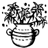
EASTER FLOWERS

As we approach the Resurrection of Our Lord from death, we call to mind all our beloved dead. Our Church decorations are a memorial to those EASTER FLOWERS who have died, to be remembered throughout the Easter season.