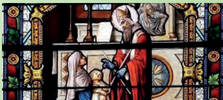
St. Blaise Bishop and Martyr February 3, 2020

The Blessing of Throats will take place at St. Catherine of Siena Chapel at the conclusion of the 9:00AM, Mass on Monday, February 3 rd , the Feast Day of St. Blaise.