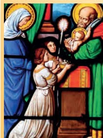
World Day for Consecrated Life

"Through the intercession of Saint Blaise, Bishop and Martyr, may God deliver you from ailments of the throat and from every other evil. In the name of the Father, and of the Son, and of the Holy Spirit. Amen."