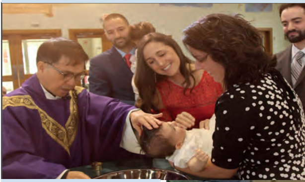
SACRAMENT OF BAPTISM