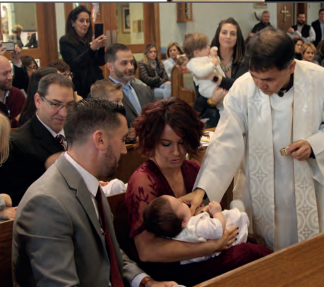
SACRAMENT OF BAPTISM