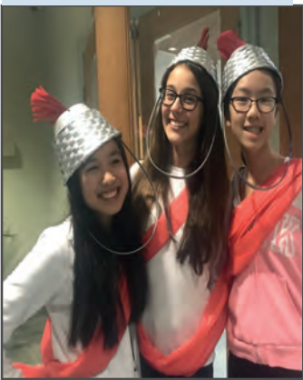
LIVE SATIONS OF THE CROSS