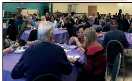
LENTEN SOUP SUPPER