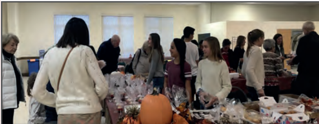
ST. CATHERINE OF SIENA YOUTH VOLUNTEERS