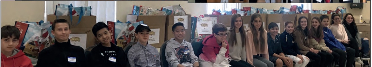
The Good Samaritan Ministry Thanksgiving Food Baskets