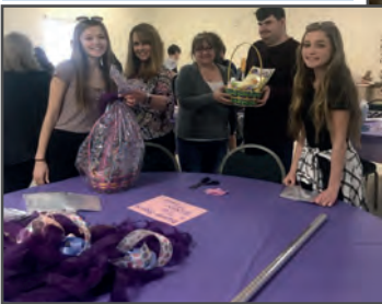
EASTER BASKET DRIVE