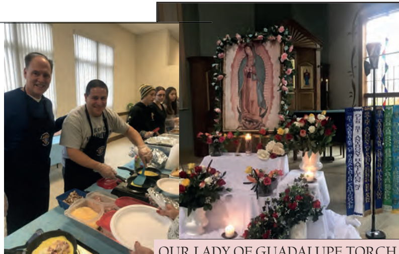
OUR LADY OF GUADALUPE TORCH