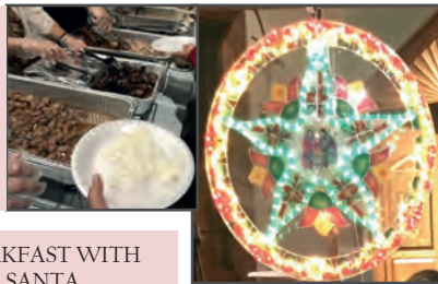
BREAKFAST WITH SANTA