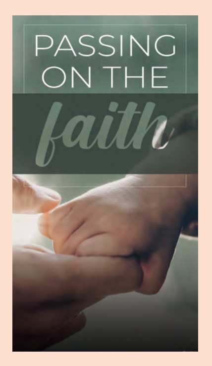
JOIN OUR TEAM!

Please register online by visiting our website, www.sienachurch.org.