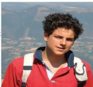
Blessed Carlo Acutis

“The Eucharist is my highway to Heaven.”